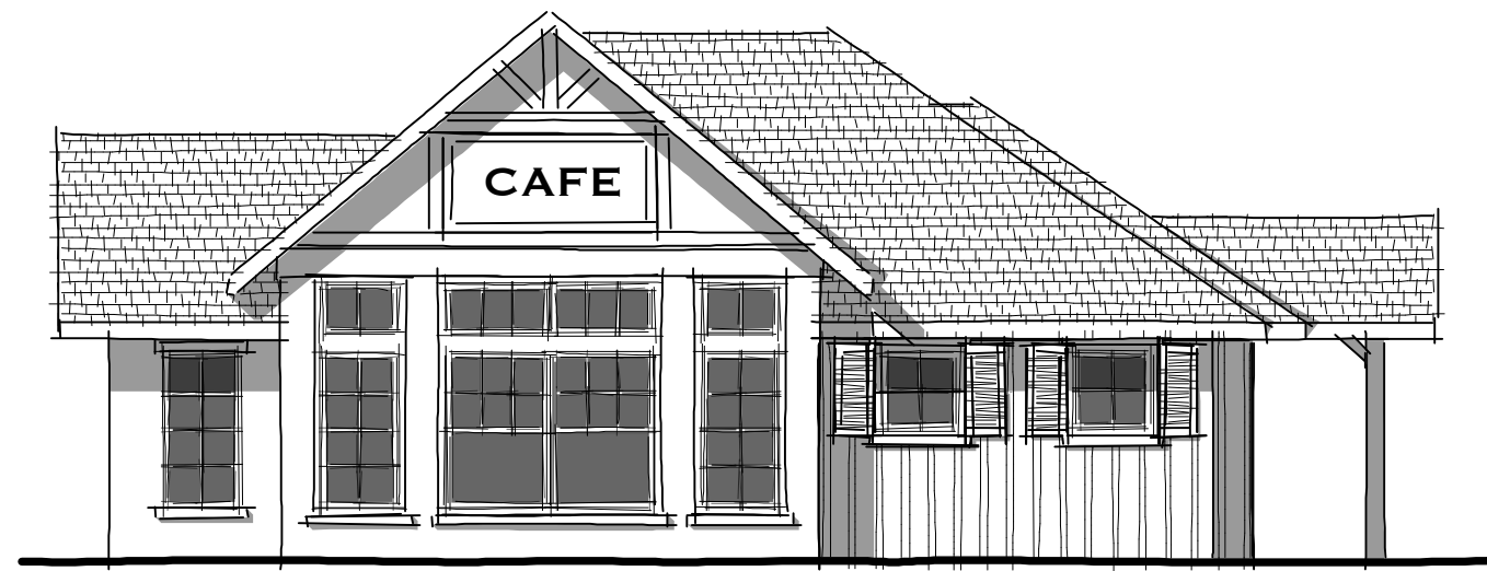
RIGHT ELEVATION G