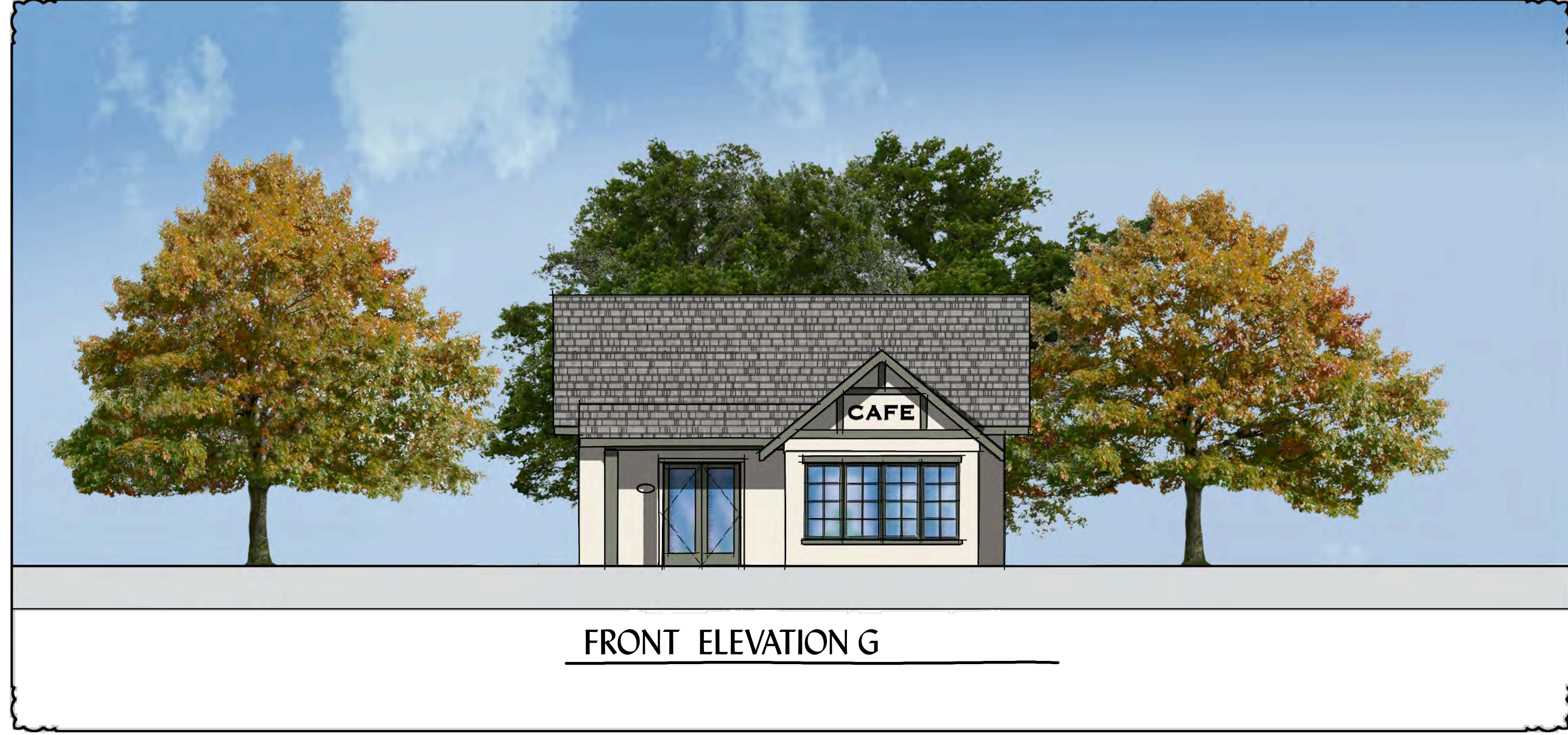
FRONT ELEVATION G